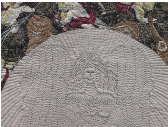
Detail image of artwork

The format of the piece is reminiscent of iconography created for Byzantine and Orthodox Christian traditions from the 17th century forward.